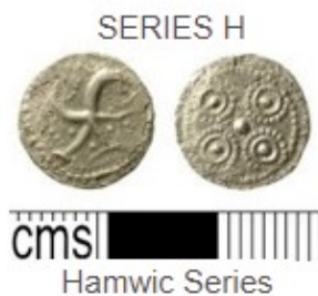
cms Hamwic Series