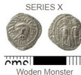
cms Woden Monster