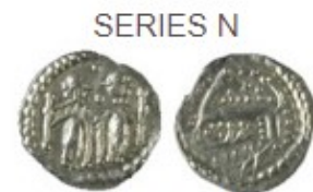
Two Standing Figures Types