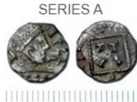
Radiate bust/standard type

Although sceattas present many problems of organization, attribution, and dating, they also carry a breathtaking variety of designs bespeaking extensive Celtic, classical, and Germanic influences. It has been suggested on the basis of the iconography of certain sceattas that they were issued by ecclesiastical authorities.