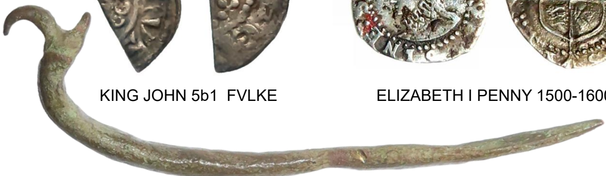
COLCHESTER ONE PIECE BROOCH AD25-60