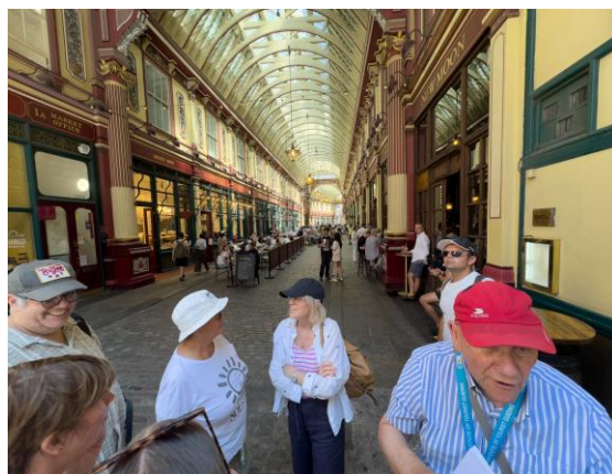
Right: Leadenhall Market a charming historic market located in the heart of the City . Dating back to the 14th century, this covered market boasts stunning Victorian architecture