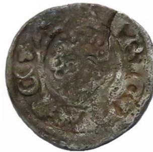
HENRY III PENNY 7b1 CANTERBURY