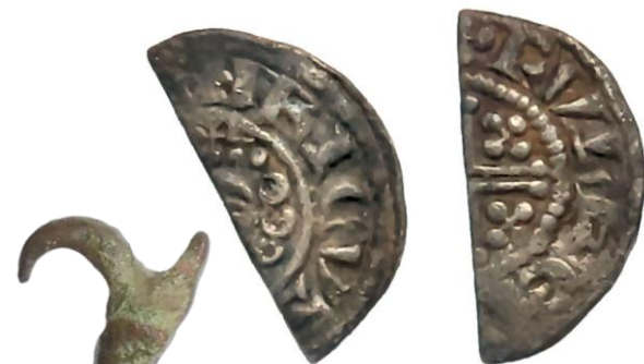
KING JOHN 5b1 FVLKE