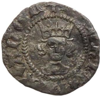
HENRY VI HALFPENNY 1430-1431 CALAIS

July has been a dry month and members have been struggling, but here are a few finds