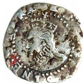
ELIZABETH I PENNY 1500-1600